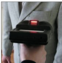
Full body scan in 15 sec.