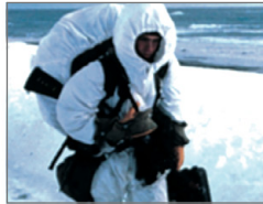
Through heavy coats and severe weather gear