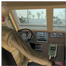
Vehicle Mounted Components