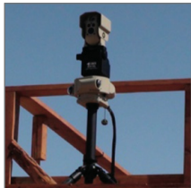
Ground Station Mount