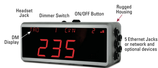
Bridge Display Module