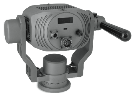
Distance, Voice and Data