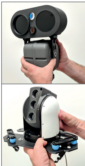
Lightweight, man portable design