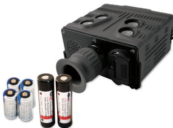
Dual battery power supply