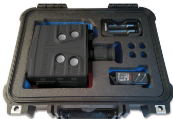
Complete Beam™ 85 kit