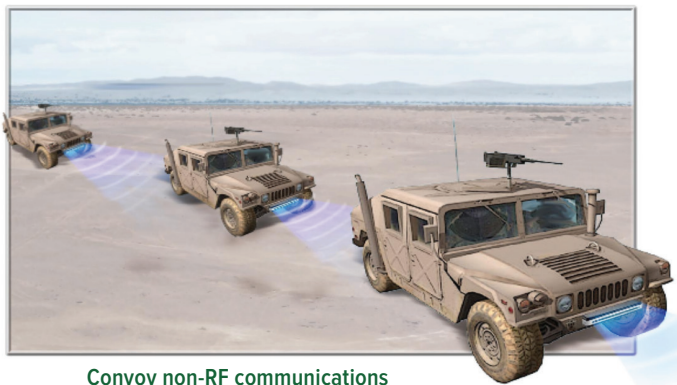
Convoy non-RF communications