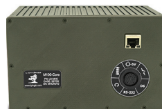
Integrated back panel interface