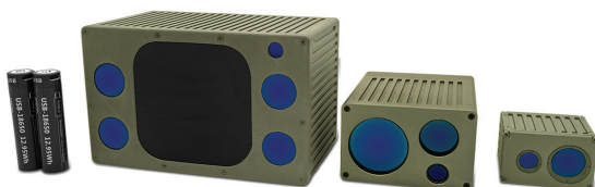
M100-, M-, and K-cores