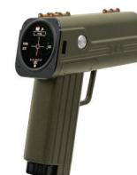
DL1 - Optical Remote Control