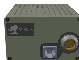
Integrated back panel interface