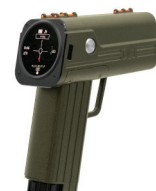
DL1 - Optical Remote Control