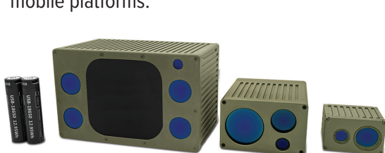
M100-, M-, and K-cores