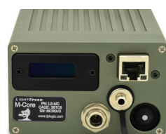
Back panel with Ethernet, Audio and Control