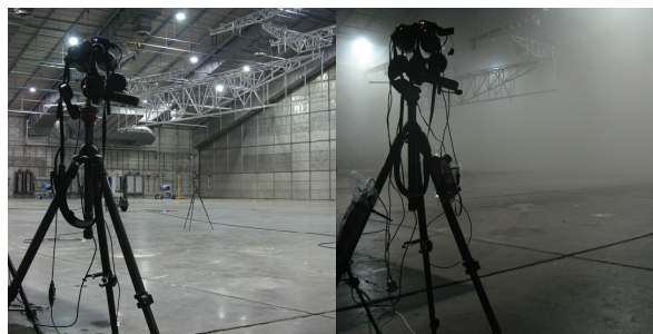
Fog and environmental testing