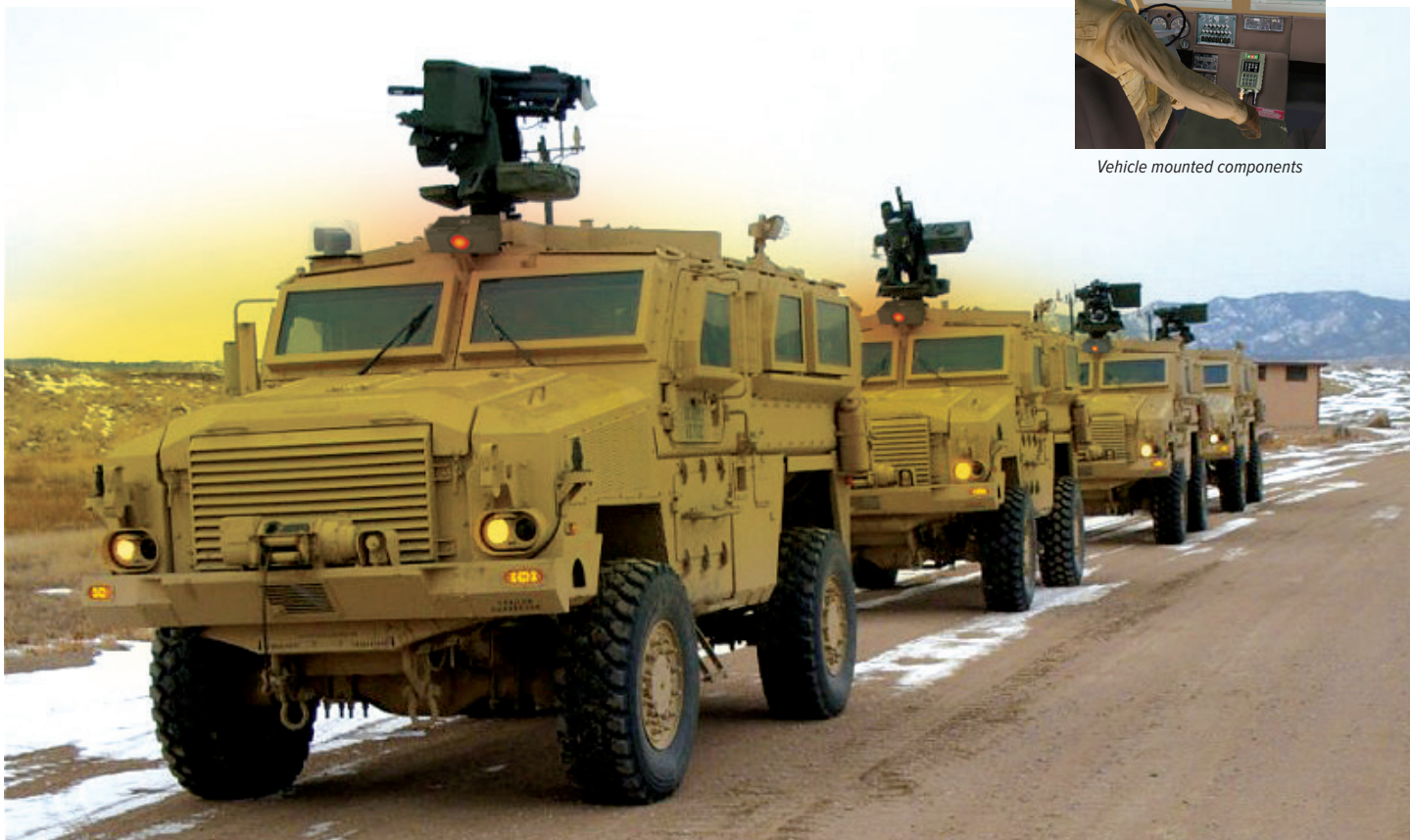
Vehicle mounted components

An electro-optical communications system is used as an extension to a vehicular intercom system to provide 2-way voice and data communications throughout a convoy. This system benefits counter IED operations under the prevention tenet lane in that the system may be used to maintain networked communications throughout the convoy while operating under radio silent or RF (Radio Frequency) denied (jammed) environments. The optical system operates in the infrared range, compatible with night vision systems, and uses LED (not laser) based emitters in eye-safe wavelengths. Optical signals are relayed between vehicles, the system works on the move or while halted (eliminating the need for field wire intercom connections).